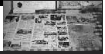
EXHIBIT RENOVATION PROGRESS REPORT